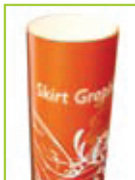
Skirt Graphic (Optional)