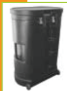
Solid Travel Case

ONLY $2299.00 +gst COMPLETE 3 panel display - artwork additional if required